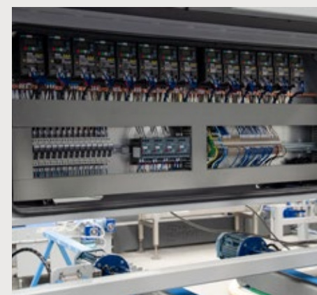
Electric cabinet at high, accessible position and clearly visible through transparent Lexan