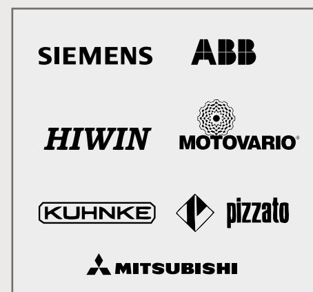
High quality components, ISO certificated.