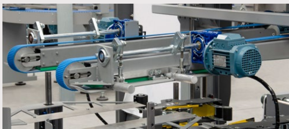
Motorized movements allow fast format change, while linear guides ensure high precision