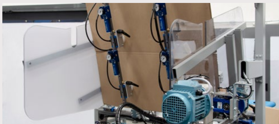
Carton cases opening by suction cups