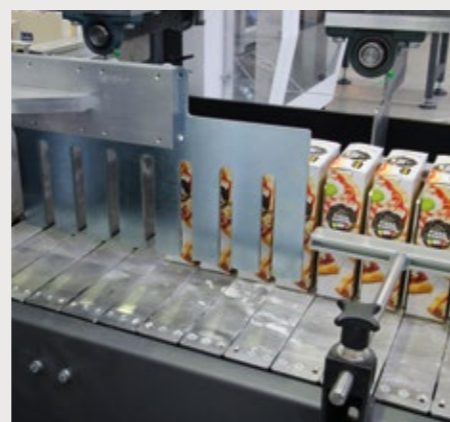
Automatic pushing system allows the products to be gathered in multipacks.