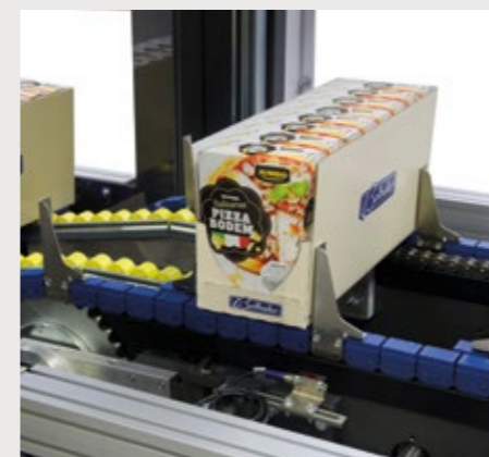
Highly accessible machine for quick diagnostic. Easy maintenance and cleaning.