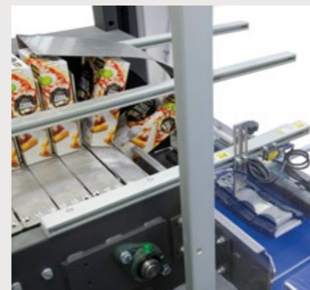
Adjustable infeed belt depending on products size and grouping configurations.