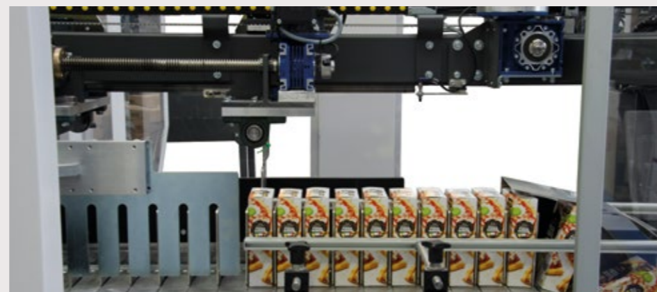
Compact and ergonomic machine with easy opening doors on all sides, highly accessible for the operators.