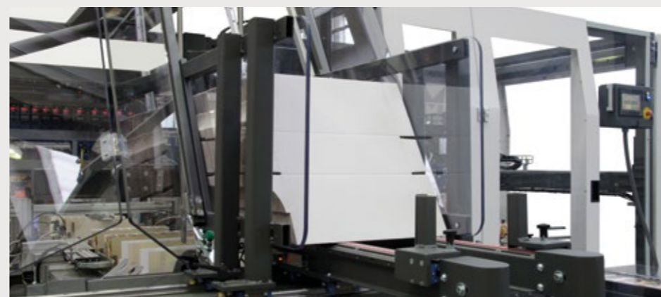
Wide blanks magazine for different carton sizes. Quick and easy change of format.