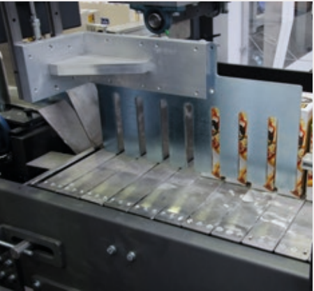
The automatic pusher allows products to be grouped and inserted with precision inside the tray/box.