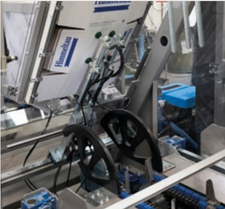
Loading and grouping systems designed to measure of the product to process.

The DRON tray packer & wrap around machine works with flat boxes to create a Wrap around type box, tray displays, trays, boxes + internal or external lid. The standard dimensions of the boxes/trays vary from a minimum of 170x100x100 mm to a maximum of 600x600x400 mm. Bigger or smaller formats are available on request. It is available in the intermittent and continuous versions and can also be used in bypass mode.