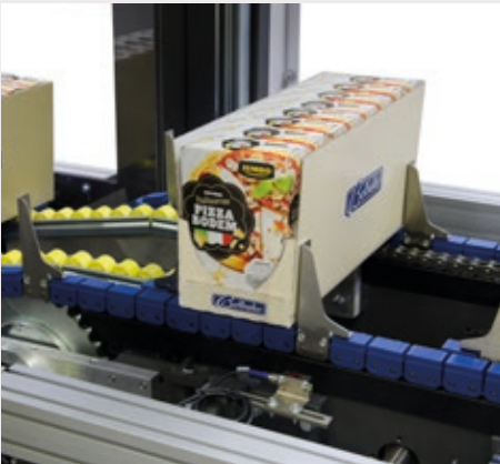
Safe and stable cardboard outfeed thanks to conveyors designed to product measurement.