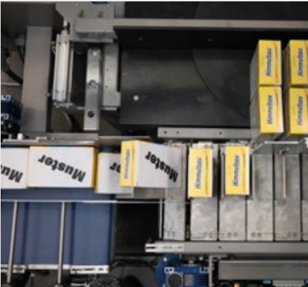
Adjustable infeed belt depending on products size and grouping configurations.