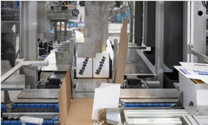
Compact and ergonomic machine with easy opening doors on all sides, highly accessible for the operators.

Other carton dimensions can be processed on request.