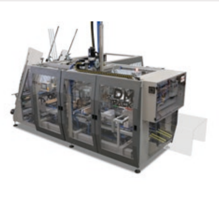
Compact and ergonomic machine with facilitated opening on all sides, highly accessible by the operator.