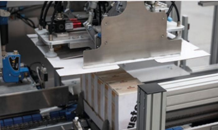
Possibility of creating various types of packages with the same machine: wrap around, bottom + lid, tray. Second box storage for lid application.