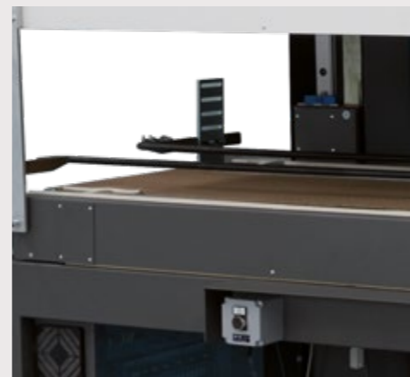
Opening chamber available for cleaning and maintenance.