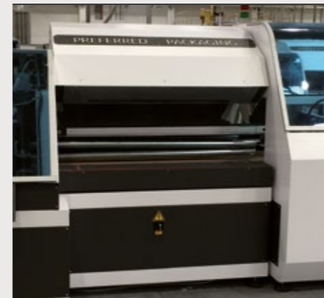
Smart & inline design