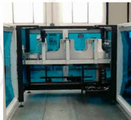
Opening doors for a complete access.