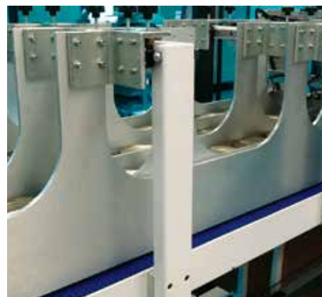
Adjustable guides for multipack preparation.