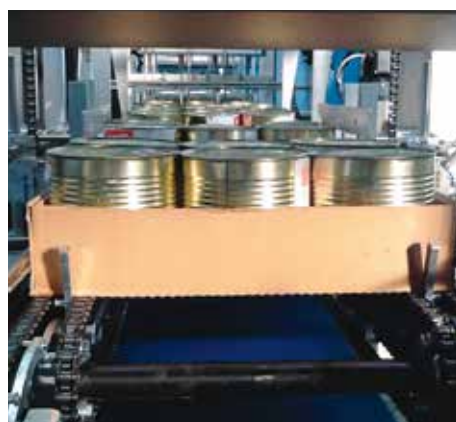
Final result after tray erection around product.