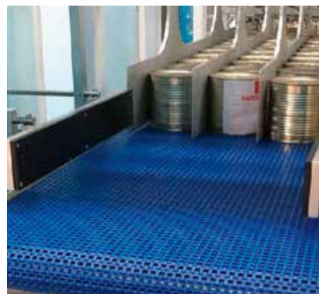
Infeed belt. Adjustable for different products size and grouping to ensure highest flexibility.