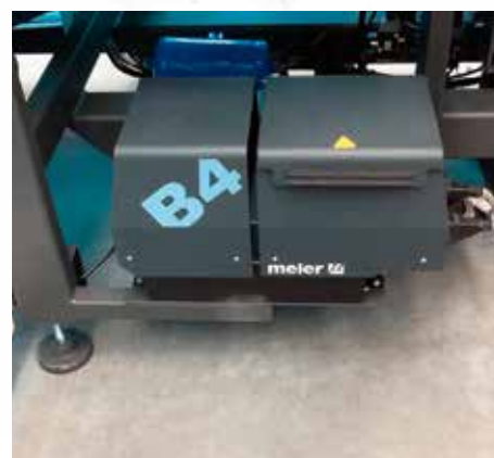
Hot melt system.