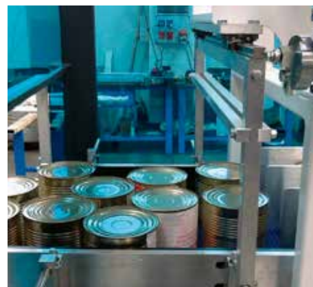
Shacking system before guides insertion.