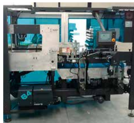
Completely opening machine.