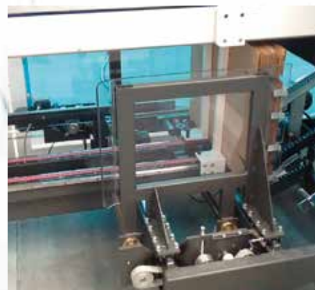
Cartoon magazine for different sizes.