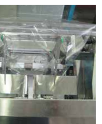
Precise product's detection thanks to bar-

High quality ISO certificated components.