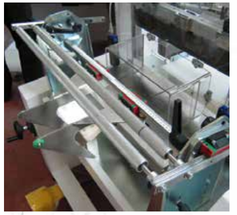
An adjustable tunnel allows the packaging of a lot of different kind of products with wide range of measures.