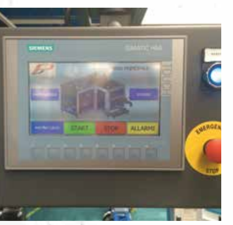
Machine controlled by Siemens PLC and intuitive touch panel. Auto adjustable change of format.