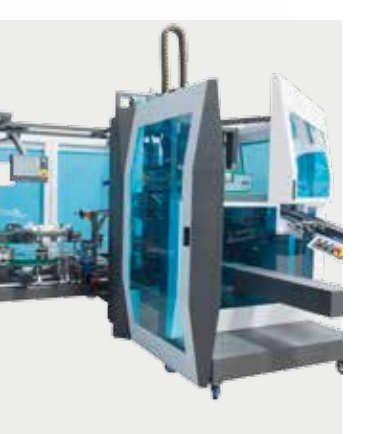
are fully accessible by innovative sliding control panel. or opening guards. The collation module can easily be separated from the case packer module for change over and.