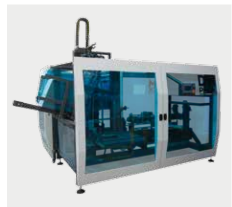
New ergonomic design. All machine parts Double operator position, thanks to rotary

PREFERRED PACKAGING ITALY srl - Sede operativa: Via dell'Artigianato, 34 - 36030 San Vito di Leguzzano (Vicenza) Italy Tel. + 39 0445 580093 - Fax + 39 0445 584609 - Tel. e Fax + 39 0445 602907 - info@preferredpack.it - www.preferredpack.it Magazzino e logistica: Via Tolomeo, 11 - 36034 Malo (Vicenza) Italy